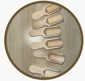
ITEM ID: 612 WOODEN SCOOPS