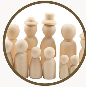
ITEM ID: 611 WOODEN PEG DOLLS