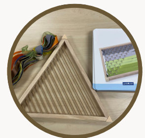
ITEM ID: 618 JUMBO WEAVING FAMES