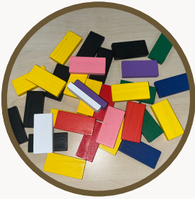
ITEM ID: 610 COLOURFUL WOODEN DOMINOES