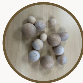
ITEM ID: 614 WOODEN BALLS