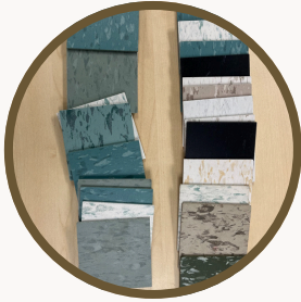
ITEM ID: 619 ASSORTED TILES