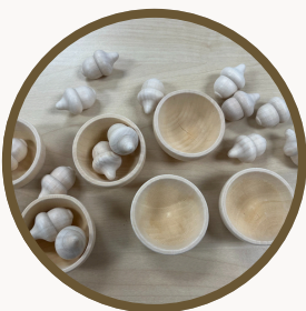
ITEM ID: 616 WOODEN ACRONS