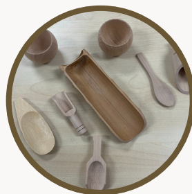
ITEM ID: 617 MINI WOODEN SPOONS