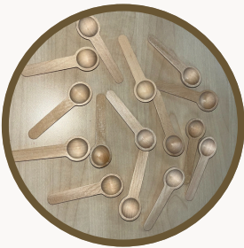
ITEM ID: 613 WOODEN SPOONS